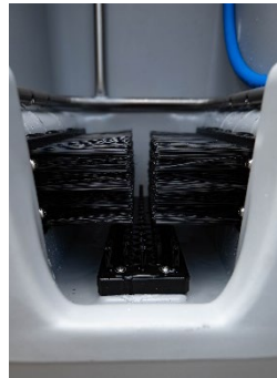
Sole and shaft cleaning brushes