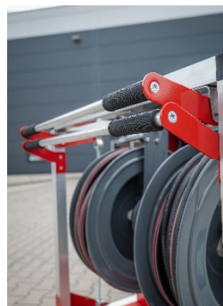
Dead man's brake (pulling)