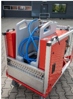
Trolley acc. to DFV and AGBF guidelines

Optional addition of a towel rail and/or washbasin