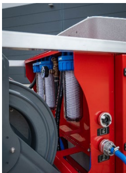
3-stage sewage water filtration