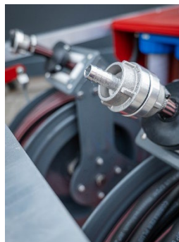
2 hose reels with water and sewage water hose