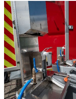
Additional towel rail + washbasin optional