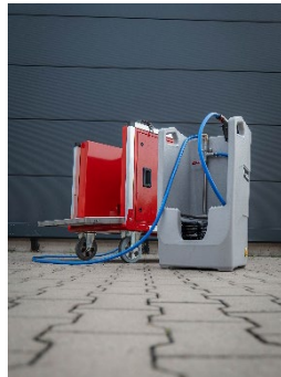
Removable boot washing machine